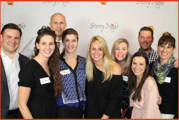
Guests at Starry Night 2019, the kick-off event for the Easterseals Wisconsin Annual Campaign.

An alternative way of helping out is by serving as an Easterseals Wisconsin Ambassador, inviting potential donors to Starry Night, the kick-off event for the agency's Annual Campaign, which will be held March 10th in Madison.