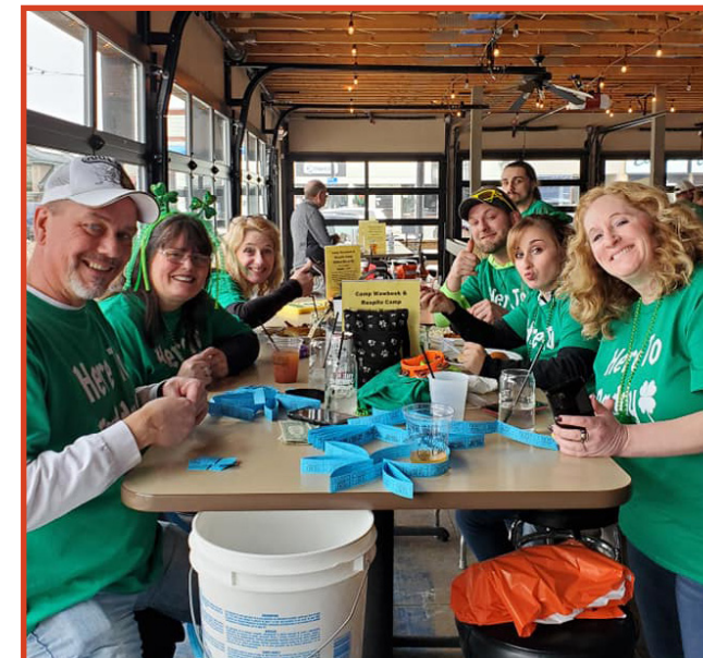
Guests enjoy a day out at Winter Warm-Up 2020

Please check our website for event updates and possible cancellation due to Covid-19.